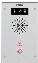
i16SV Video Intercom