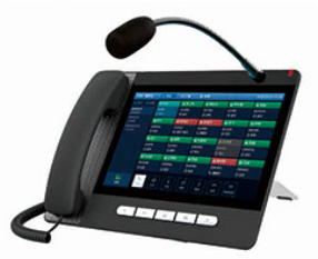
A32i Android Console IP Phone