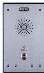
i12 Audio Intercom