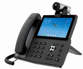
X7A Android IP Phone with Camera