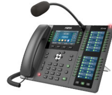
X210i Console IP Phone