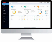
Fanvil Device Management Solution (FDMS)