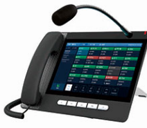
A32i Android Console IP Phone